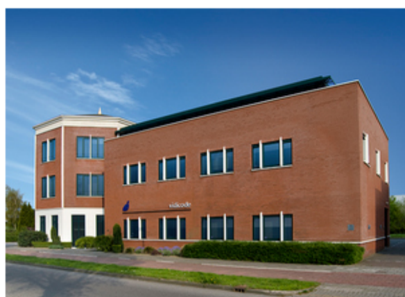
Vidicode in Zoetermeer

Bank: RABO Vlietstreek Zoetermeer, PO box 21, 2700 AA Zoetermeer, The Netherlands BIC: RABONL2U IBAN: NL97 RABO 0142 9378 00 VAT Registration : NL819414773B01